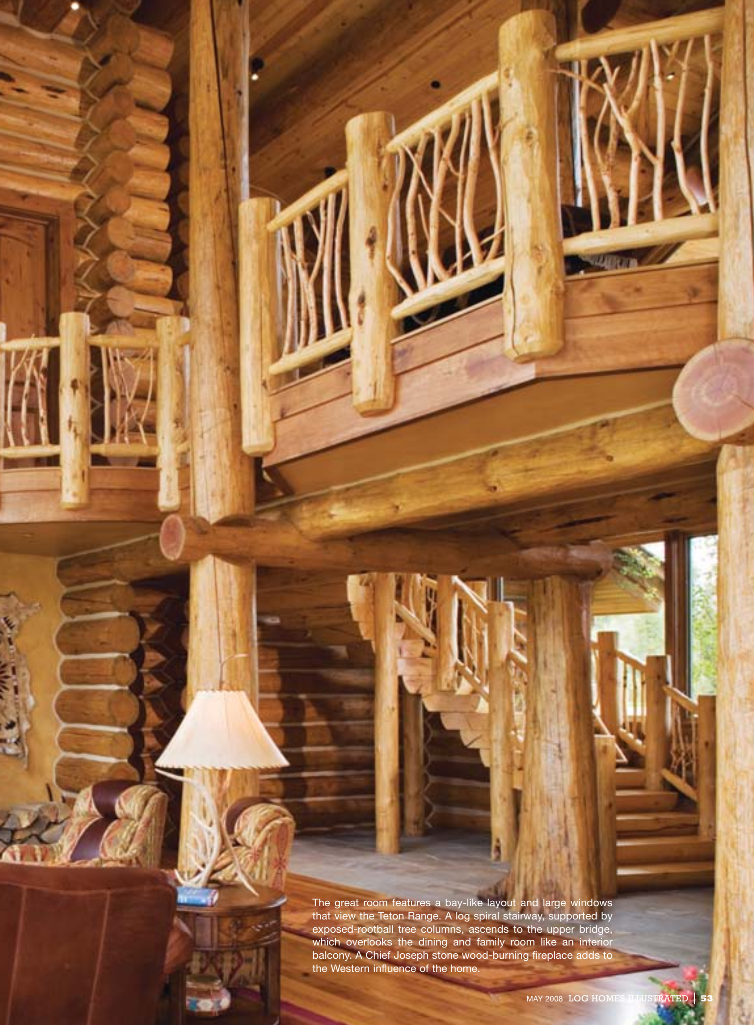
The great room features a bay-like layout and large windows that view the Teton Range. A log spiral stairway, supported by exposed-rootball tree columns, ascends to the upper bridge, which overlooks the dining and family room like an interior balcony. A Chief Joseph stone wood-burning fireplace adds to the Western influence of the home.