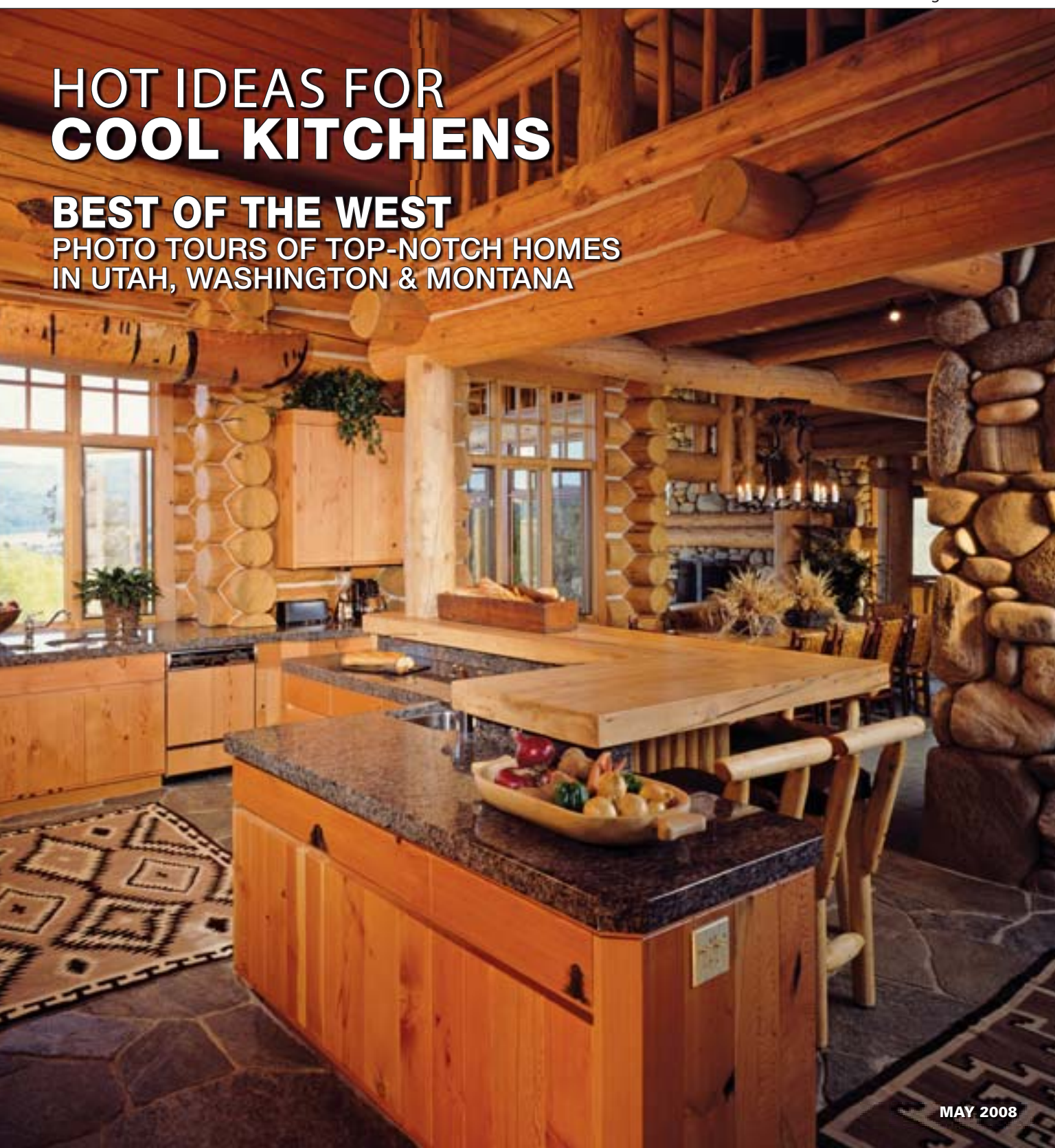
PHOTO TOURS OF TOP-NOTCH HOMES IN UTAH, WASHINGTON & MONTANA